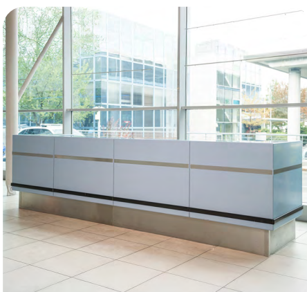
• Terminal 2 Counter