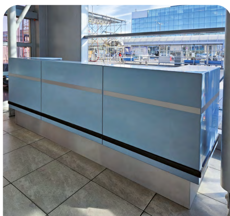
• Terminal 1 Counter